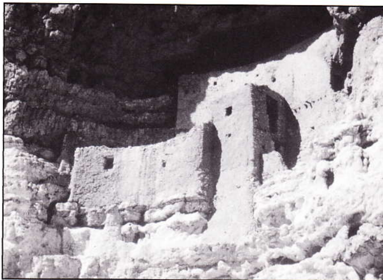
Evidence of prehistoric cultures exists in the Verde Valley.

Montezuma Castle is located about 50 miles south of Flagstaff, 90 miles north of Phoenix. Visitors can reach the park by taking exit 89 off I-17 and following the signs for three miles to the visitor center parking lot. Entrance fee is $2 per person; children 16 and younger are admitted free of charge. Golden Eagle passports are honored.